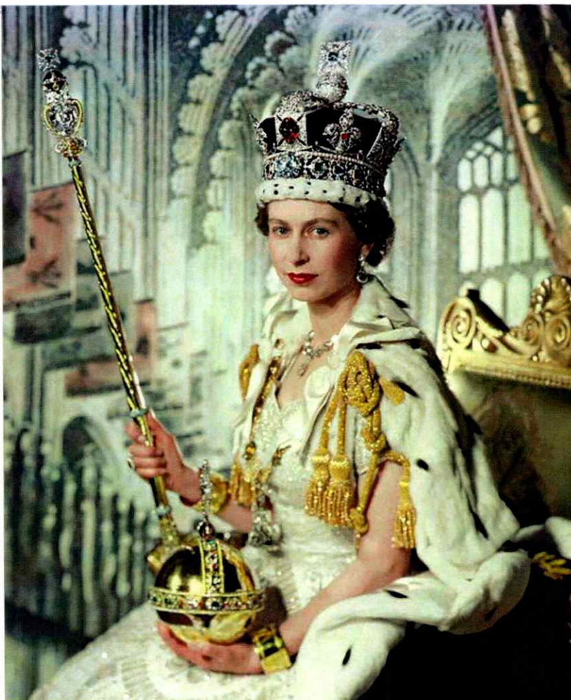
Elizabeth II, 1953

Start by building a tree for your French ancestors, then dive into the largest online source of