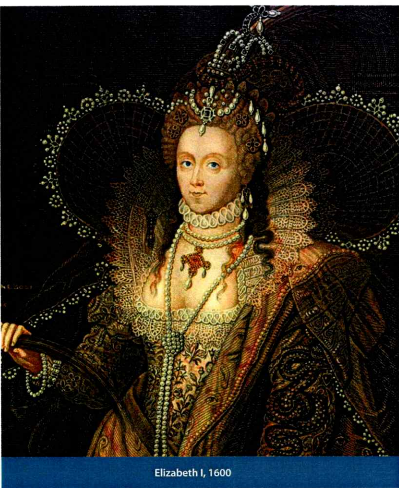
Elizabeth I, 1600